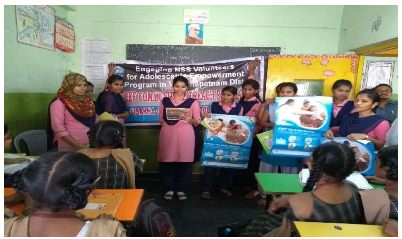
Showing charts and pictures to the school students

PRINCIPAL Visakha Govt. Degree College (W) VISAKHAPATNAM - 20