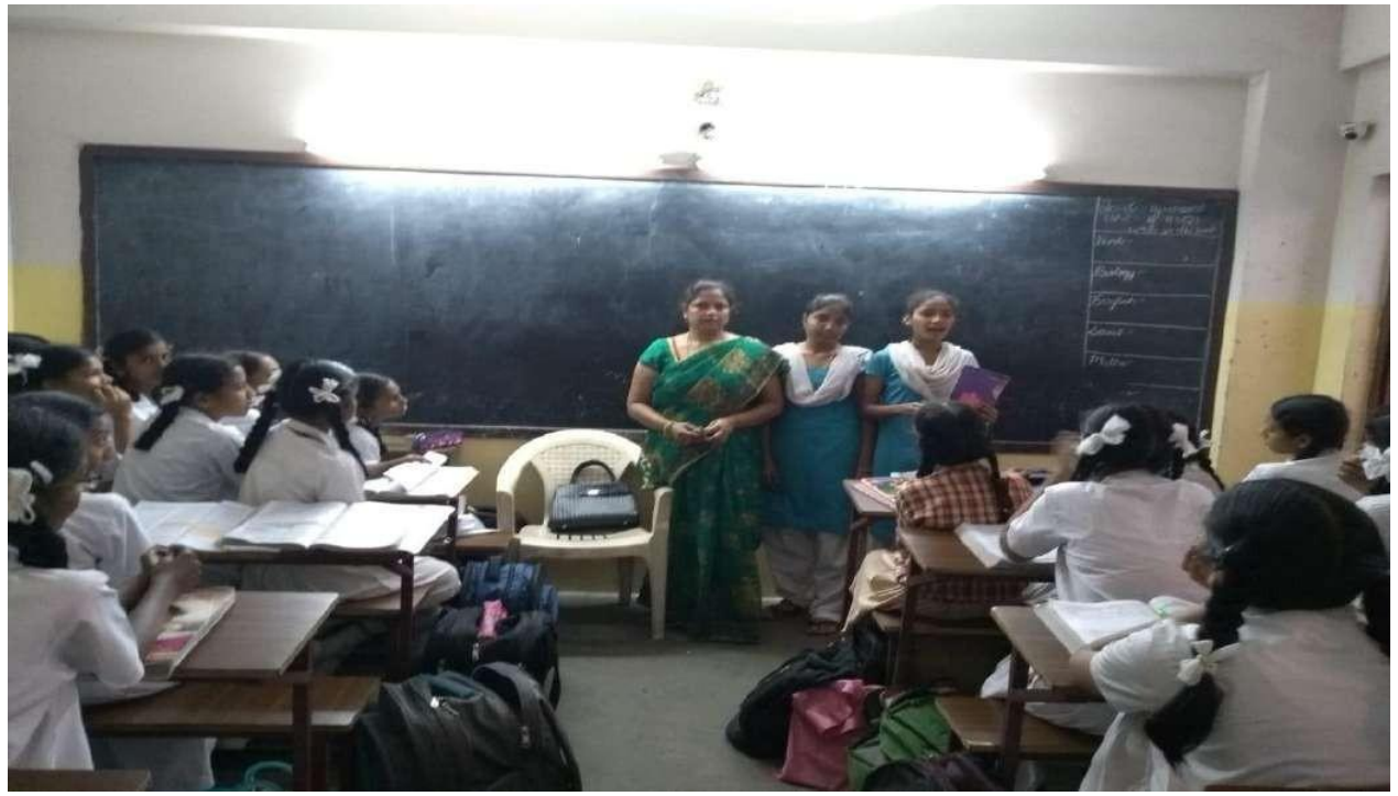
To create awareness among the students and community about the adolescent's issues and improving their lives at Priyanka Vidyodaya School

National Service Scheme in collaboration with Women empowerment cell