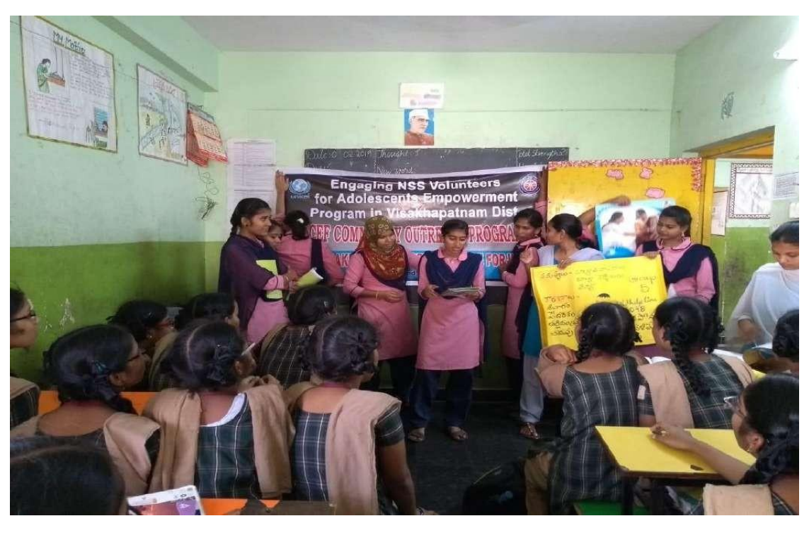
Students explaining about the adolescent's issues and improving their lives at Ravindra Bhartahi EM School